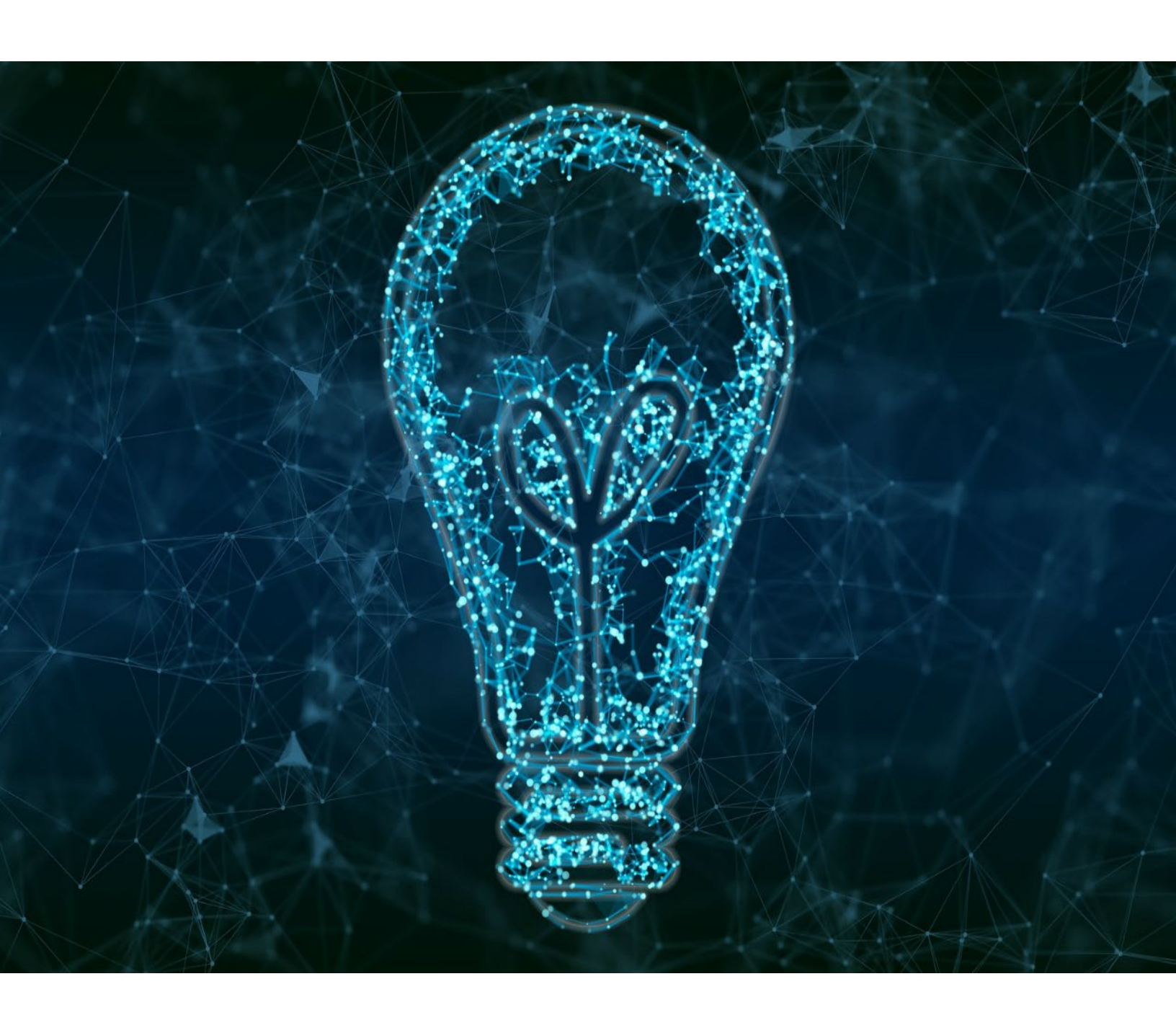
Law of Attraction for Your Desired Change