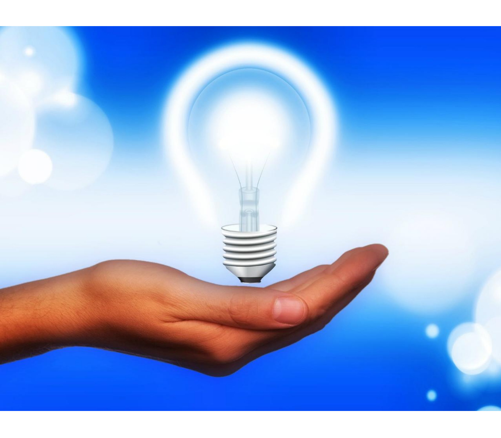
The Insight Exchange